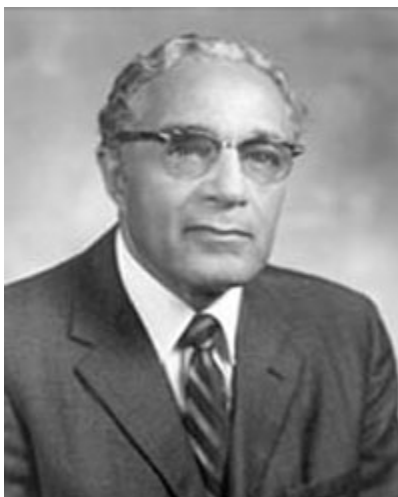
W.E.B. Du Bois

“I write then in a field devastated by passion and belief. Naturally, as a Negro, I cannot do this writing without believing in the essential humanity of Negroes, in their ability to be educated, to do the work of the modern world, to take their place as equal citizens with others. I cannot for a moment subscribe to that bizarre doctrine of race that makes most men inferior to the few. But, too as a student of science, I want to be fair, objective and judicial; to let no searing of the memory by intolerable insult and cruelty me fail to sympathize with human frailties and contradiction, in the eternal paradox of good and evil. But armed and warned by all this, and fortified by long study of the facts, I stand at the end of this writing, literally aghast at what American historians have done to this field.”