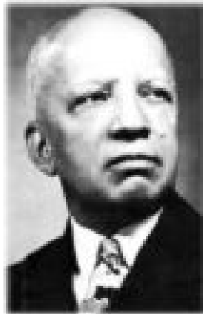
George Washington Williams

If the ‘highly educated’ Negro would forget most of the untried theories taught him in school, if he could see through the propaganda which has been instilled into his mind under the pretext of education, if he would fall in love with his own people and begin to sacrifice for their uplift—if the ‘highly educated’ Negro would do these things, he could solve some of the problems now confronting the race”