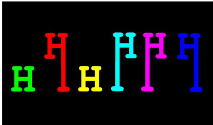
Figure : still from "Discipline"